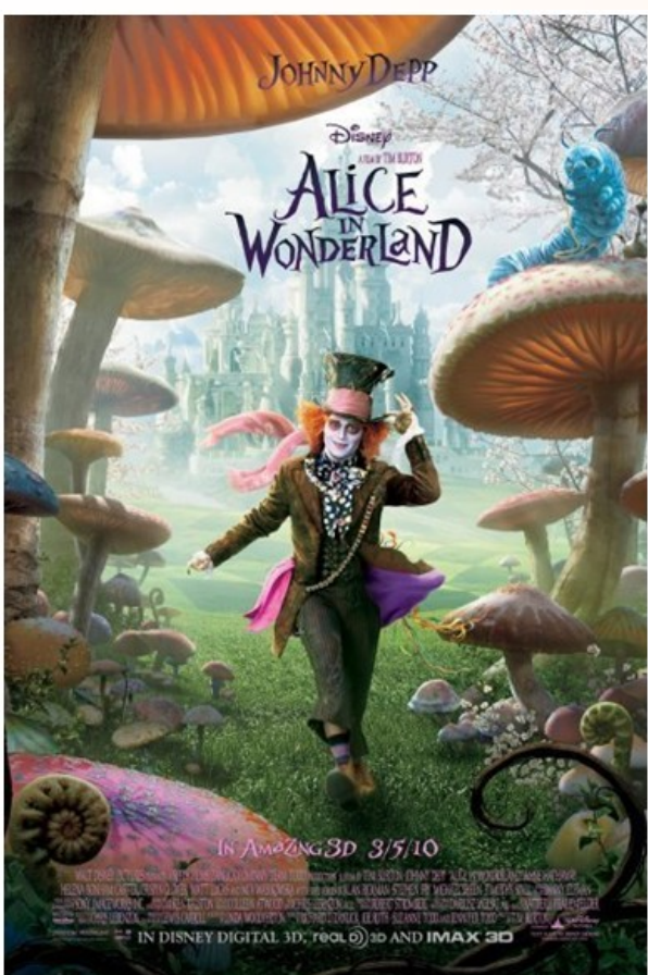
Alice in Wonderland Walt Disney Pictures, 2010

'Twas brillig, and the slithy toves Did gyre and gimble in the wabe: All mimsy were the borogoves, And the mome raths outgrabe.